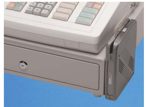
DataTran™ Integrated Credit Option