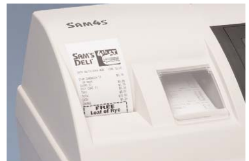
Quick and Easy Drop and Print Paper Loading