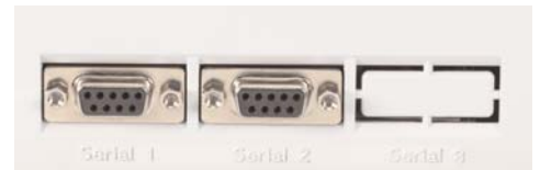
Two Standard RS-232C Ports